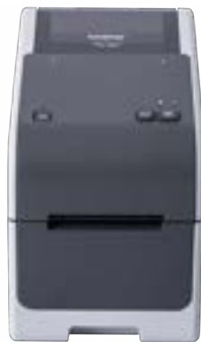
TD-2320D USB, Serial & Ethernet