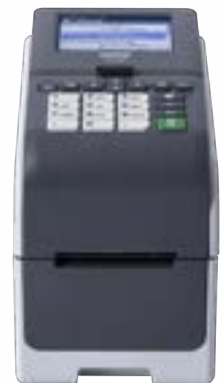
TD-2350DSA USB, Serial, Ethernet, Wi-Fi® & Bluetooth®