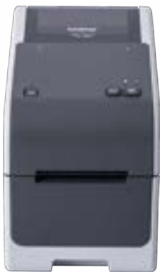
TD-2310D USB & Serial