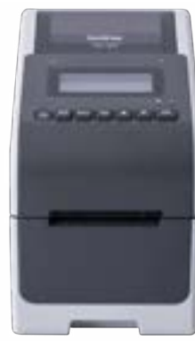
TD-2350D USB, Serial, Ethernet, Wi-Fi® & Bluetooth®